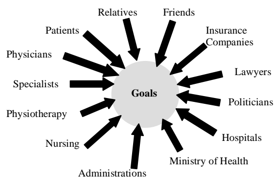
Figure 3. Lack of a common goal divides stakeholders in the health care system: As many goals are pursued as there are persons involved. Presumably this is a central reason for the different crises and the slow progress of health care systems.

Another independent method to appreciate the importance of a definition of health may be derived from the social systems theory [9]. Table 1 shows some essential